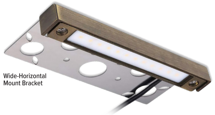
Wide-Horizontal Mount Bracket